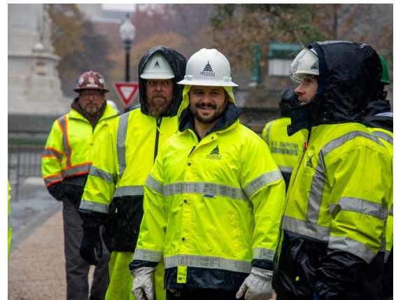
RESOURCES ARE NEEDED TO KEEP PACE WITH GROWING OPERATIONAL AND PROJECT SUPPORT REQUIREMENTS

With the expansion of new responsibilities and the ongoing and planned construction of new facilities both on and off campus, additional in-house resources are needed to lead and manage increasing campus-wide project design and development, construction oversight, and project management requirements. Personnel are required to reduce contract award and administrative lead times, and to avoid project delays and cost overruns. As our campus ages and our systems are updated, we need better support for emergency response, fire safety inspection efforts and oversight of fire and safety operations.