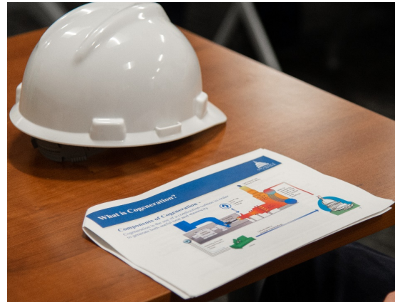
THE AOC'S RISK-BASED PROJECT PRIORITIZATION PROCESS STRATEGICALLY IDENTIFIES PROJECTS

Adhering to a plan is important to me. Each year we use a risk-based process to prioritize needed projects. In FY 2020, we are requesting $175 million for projects that will provide necessary maintenance to our energy delivery infrastructure, facilitate the next presidential inauguration as well as enhance security measures around the campus.