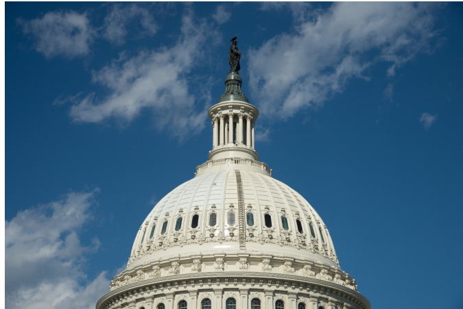
U.S. CAPITOL DOME AND THE STATUE OF FREEDOM

Prior to becoming Acting Architect of the Capitol, I spent eight years as the Deputy Architect of the Capitol and the Chief Operating Officer. I learned much about the agency, Congress and the needs of the Capitol campus in that role. And I am energized by the people who work here. The AOC's small but nimble group of employees is not always recognized, but their work matters greatly, and they have a passion and desire to do the best job possible to serve Congress and the Supreme Court, preserve America's Capitol, and inspire memorable visitor experiences.