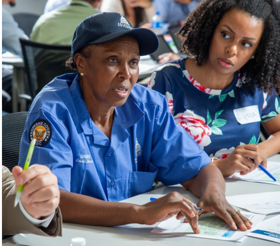
AOC EMPLOYEES ARE HIGHLY SKILLED, WELL-TRAINED AND EXTREMELY DEDICATED

The AOC has some of the most talented and widely admired craftsmen, tradesmen, artists, architects, engineers and scholars. Over the years, our agency has earned a well-deserved reputation as an agency with a “can-do” attitude. We have taken on new responsibilities and are committed to meeting ever-increasing workloads. However, there are areas that we need to improve. The most significant of these is attracting and retaining talented employees.