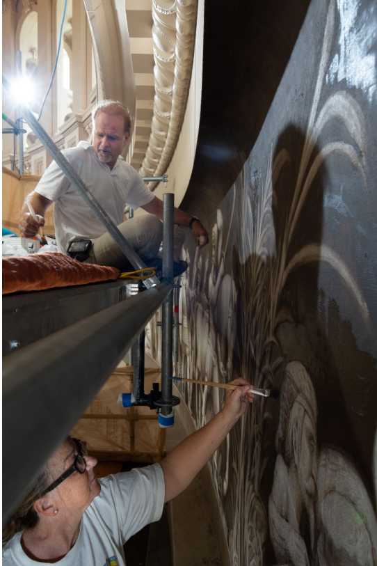
CONSERVATION WORK ON THE ROTUNDA FRIEZE

Our heritage assets include buildings, monuments, landscapes, fountains, fine art, archival records and botanic assets. Their value is priceless. Over the last several years, we have expanded our foundational preservation documents, including building preservation guides and cultural landscape reports. We use these documents and our historic preservation policy as planning tools for restoring, renewing and reclaiming our heritage assets to a standard that is appropriate for the nation's capital and the worldwide symbol of American democracy.