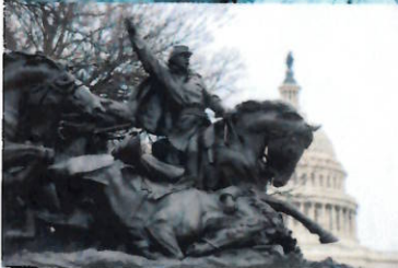
GRANT MEMORIAL RESTORATION BEFORE AND AFTER

In the fall, we celebrated the once-in-a-generation restoration of the U.S. Capitol Dome and Rotunda. With the support of the Congress, hundreds of expert craftsmen worked day and night to restore the Dome to its original inspiring splendor.