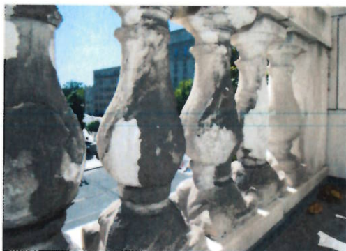
DETERIORATION OF THE RUSSELL SENATE OFFICE BUILDING EXTERIOR ENVELOPE

In addition, using the AOC's risk-based project prioritization process, we are recommending 21 Line Item Construction Program projects totaling $240 million. Of this, $166.4 million (or 69 percent) is specifically for projects classified as Deferred Maintenance (repair or replacement is past due, in some cases significantly) or Capital Renewal (approaching the end of useful life).