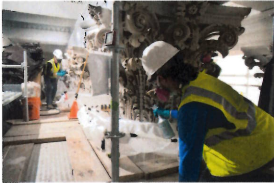
STONE PRESERVATION AT THE U.S. CAPITOL BUILDING

In addition, we successfully completed the first phase of the Cannon Renewal project. On time and under budget, this phase included installing building utilities, primarily in the basement, and the moat area of the courtyard. This enables future work to connect to the new systems, minimizing shutdowns and disturbances.