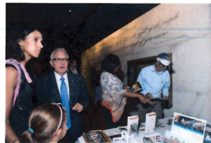
PRESERVATION DAY CELEBRATION AT THE U.S. CAPITOL VISITOR CENTER

The AOC is dedicated to creating a safe, welcoming and inspiring experience for all who visit Capitol Hill. For many visitors, this may be their first and only time seeing the nation's capital, and we work hard to ensure the experience is worthy of this working symbol of American democracy and freedom. The dedicated employees of the U.S. Capitol Visitor Center and the U.S. Botanic Garden work to enhance customer service, hospitality and visitor engagement in a seamless, cohesive and positive visitor experience. As a source for civic education, we must continue to grow our exhibit and education experiences to maintain the high level of quality visitors expect and to expand our reach to include online and virtual visitors to the U.S. Capitol.