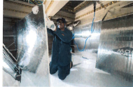
PERFORMING ROUTINE MAINTENANCE IMPROVES THE SAFETY AND SECURITY OF OUR INFRASTRUCTURE

The demand of meeting mandatory cost increases is compromising our ability to fully execute these core functions. Budget constraints have slowed our ability to perform maintenance and, rather than purchasing needed parts and service throughout the year, we are relying on temporary fixes that buy time but are not enough to prevent conditions from worsening. Across campus, we must address a growing backlog of work that is needed to keep our heating, ventilation and air conditioning equipment and electrical systems operational. Plumbing inspections, carpentry work, general repairs and emergency repairs compete for limited resources. In recent years, we have successfully managed to balance competing needs and diminishing resources, but we are now faced with critical life cycle repairs and replacement requirements that must be met to reduce the risk of system failures.