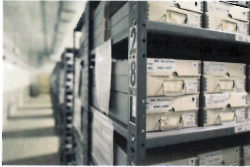
STORAGE MODULE AT THE LIBRARY OF CONGRESS FT. MEADE CAMPUS

as the Library's collections in all formats grow, the current situation continues to deteriorate, exacerbating the already dangerous conditions with regard to life-safety, research and preservation.