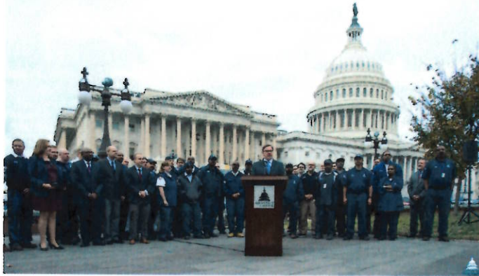
ARCHITECT OF THE CAPITOL STEPHEN T. AYERS ANNOUNCING THE COMPLETION OF THE U.S. CAPITOL DOME RESTORATION PROJECT

The AOC has a legacy that is rooted in the very beginnings of Washington, D.C., with the laying of the U.S. Capitol cornerstone in 1793. As the country grew, so did the Capitol campus and with it the AOC's responsibilities. Today, we operate and care for more than 17.4 million square feet across 36 facilities and 570 acres of grounds.