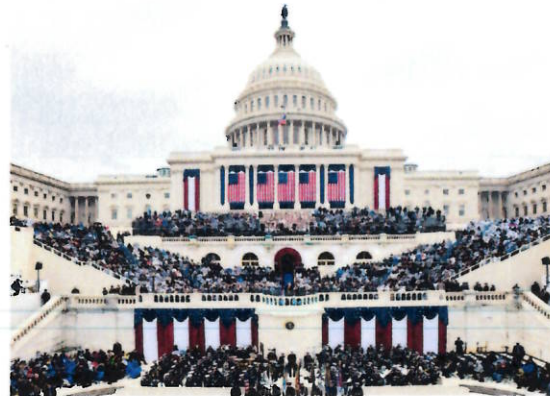
2017 PRESIDENTIAL INAUGURATION

And as we have for more than 150 years, the AOC recently supported preparations for the 58th Presidential Inauguration. We successfully constructed the inaugural platform, set up the necessary fencing, placed over 30,000 chairs on the grounds, procured the sound system and other support systems, installed the flags and bunting, and coordinated many other activities with the Joint Congressional Committee on Inaugural Ceremonies. We are extremely proud to have once again been part of this historic event.