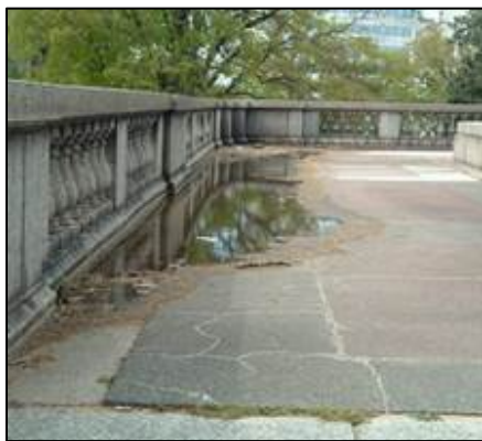
Damaged stone on the Senate Underground Garage plaza.

Damage to our crucial building infrastructure is especially concerning, such as the deterioration of several garages. We are requesting appropriations for the first of four phases to address the necessary Rayburn House Office Building Garage Rehabilitation repairs, which will focus on the severe concrete delamination and improving the structural stability of the garage. Engineering studies have identified severe corrosion of the reinforcing steel as well as spalling and delaminating concrete in the ceiling and support columns.