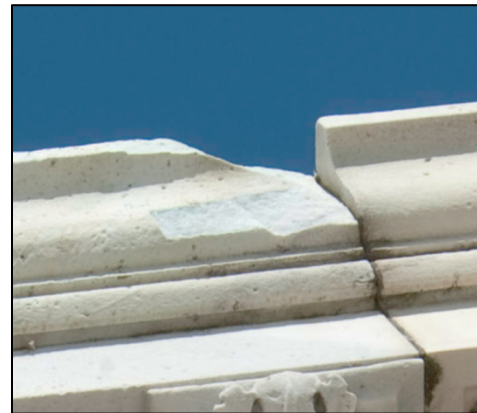
Cracked and spalling stone on the Capitol Building.

The buildings of the Capitol campus are well cared for by the dedicated men and women of the AOC who use their incredible talents and skills to maintain the buildings and grounds. However, upon closer examination, it is evident that wear and tear, weather, and environmental factors have taken their toll on the buildings. Water in particular is very destructive to stone structures. The sandstone and marble façades of our historic buildings are cracking, spalling and, most seriously, stone is actually breaking away and falling from many buildings.