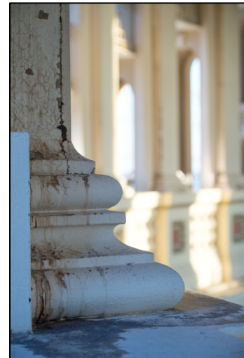
Water infiltration into the Rotunda has caused damage to cast iron columns and threatens historic artwork.

Funding our recommended projects in Fiscal Year 2015 ensures that necessary investments are made in our historic infrastructure, and increases the safety and security of those who work in or visit the facilities on Capitol Hill. In future budget requests, we will continue to include multi-phased projects to restore and repair the damage to the exterior stone to ensure that we preserve the unique and historic masonry features of the buildings that serve the Congress and the American people.