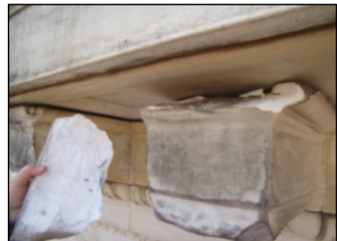
A piece of cracked stone from the Russell Senate Office Building.

Maintaining and improving the integrity of a building's exterior contributes to the overall building's performance, including energy efficiency. Cracks and gaps in the exterior stone allow heat, cold and water to infiltrate the building, raising overall energy consumption. In this vein, stone preservation continues to emerge as one of our biggest priorities. Time and weather have not been kind to the historic buildings entrusted to our care. For the long-term preservation and safety of our buildings, we must take measures to stop water infiltration and do what we can to abate the deterioration of historic stone.